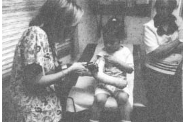
St. Jude's Medical Center