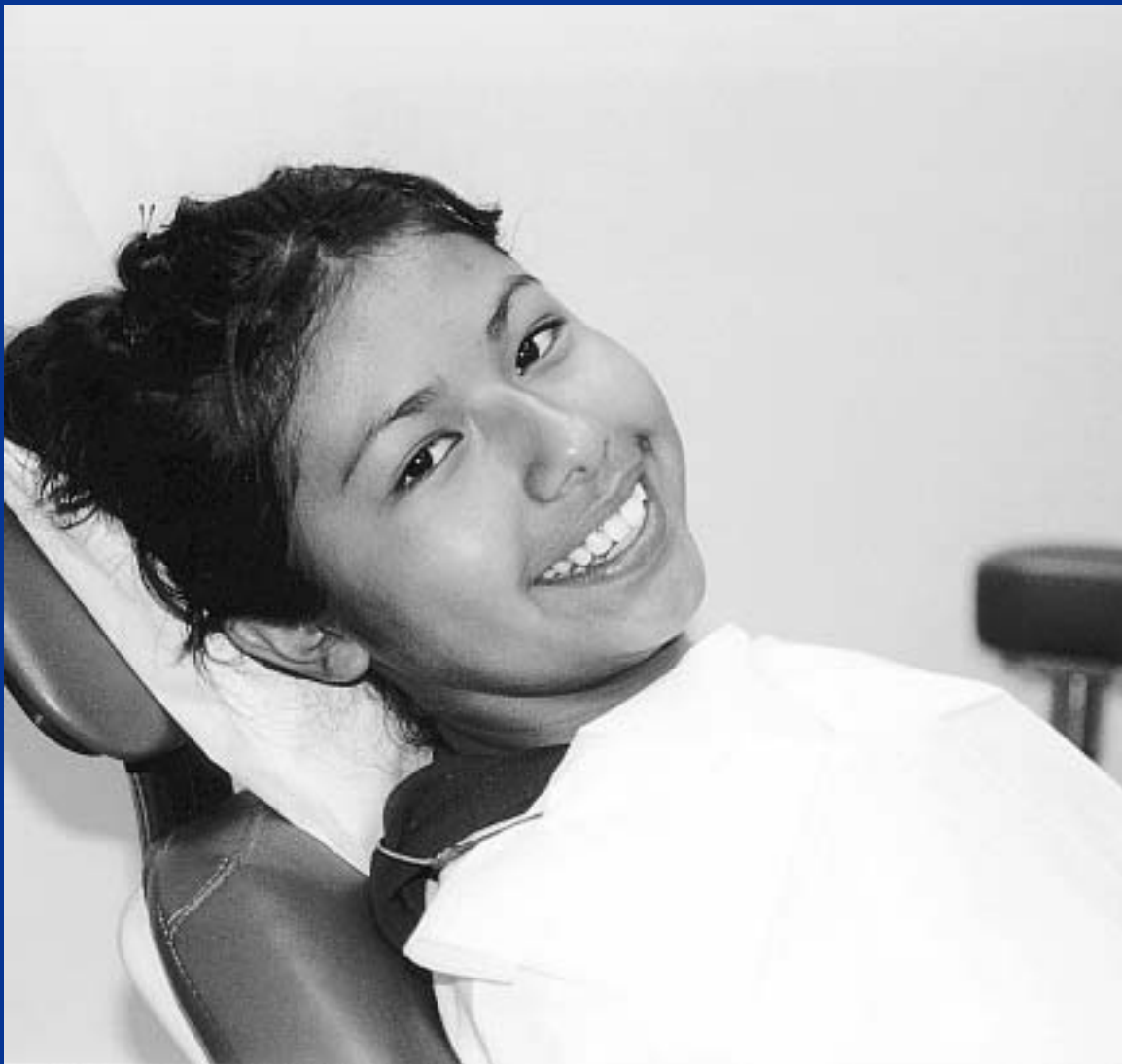
Assistance League of Santa Ana

“I wish other foundations would bring people together the way The HealthCare Foundation does.”