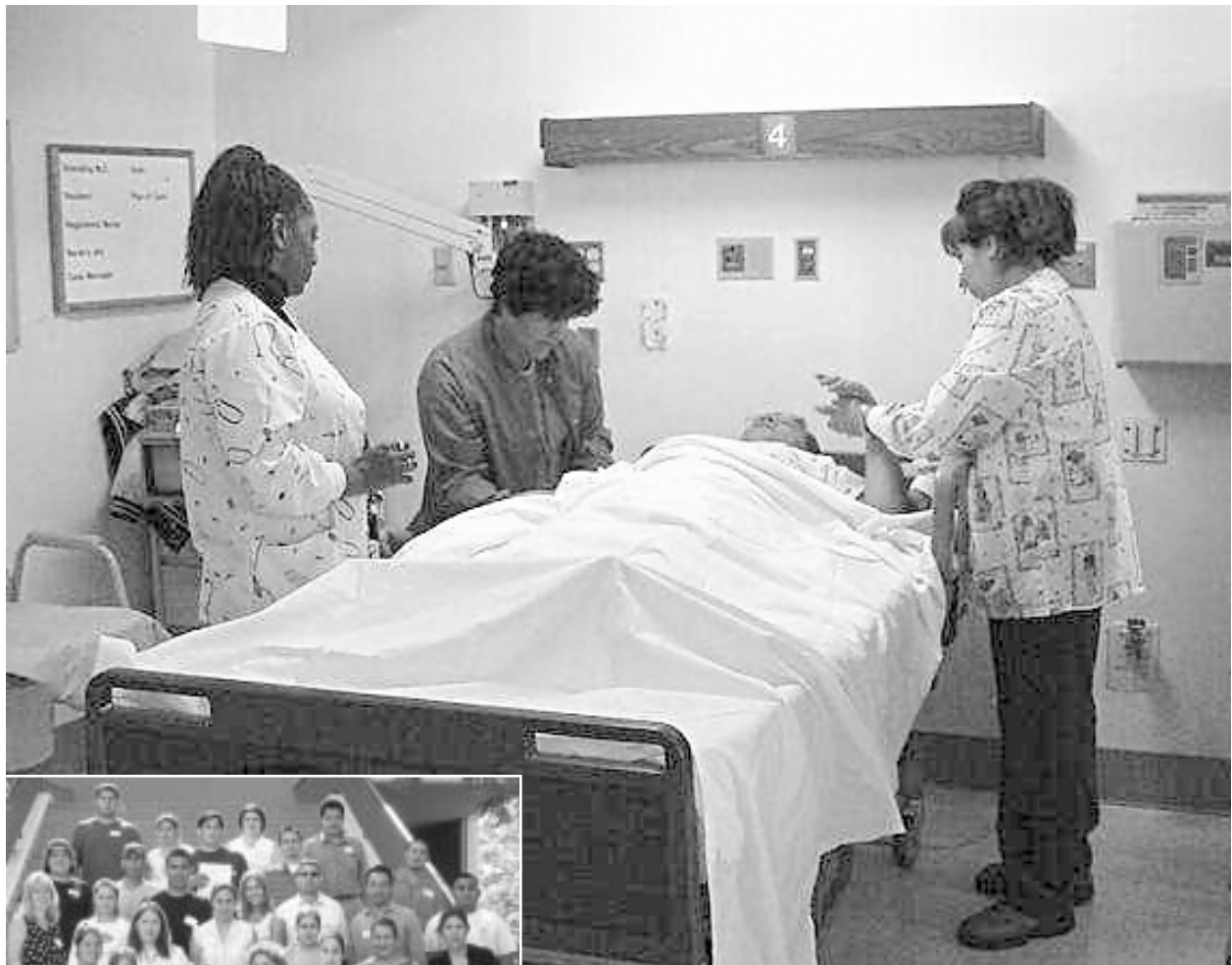
Anaheim Memorial Medical Center