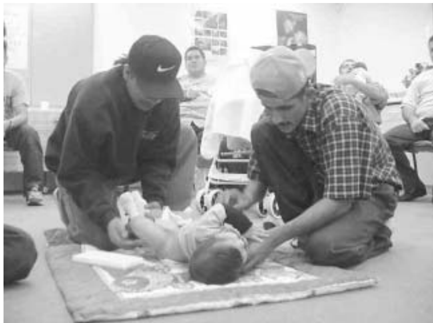
Maternal Outreach Management Systems

Insurance Cultural sensitivity Transportation